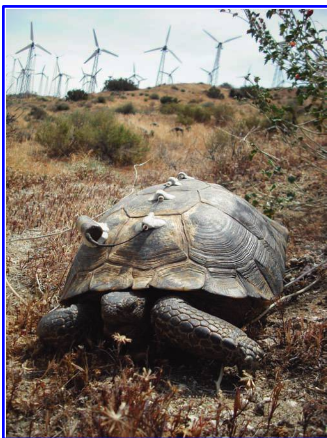
Figure 1. Agassiz's desert tortoise ( Gopherus agassizii ). Large areas of desert tortoise habitat are developed or being evaluated for renewable energy development, including for wind and solar energy.

tortoise ( Gopherus agassizii ; figure 1). Distributed north and west of the Colorado River, the species was listed as threatened under the US Endangered Species Act in 1990. Because of its protected status, Agassiz's desert tortoise acts as an "umbrella species," extending protection to other plants and animals within its range (Tracy and Brussard, 1994). The newly described Morafka's desert tortoise ( Gopherus morafkai ; Murphy et al. 2011) is another species of significant conservation concern in the desert Southwest, found east of the Colorado River. Both tortoises are important as ecological engineers who construct burrows that provide shelter to many other animal species, which allows them to escape the temperature extremes of the desert (Ernst and Lovich 2009). The importance of these tortoises is thus greatly disproportionate to their intrinsic value as species. By virtue of their protected status, Agassiz's desert tortoises have a significant impact on regulatory issues in the listed portion of their range, yet little is known about the effects of USSEDO on the species, even a quarter century after the recognition of that deficiency (Pearson 1986). Large areas of habitat occupied by Agassiz's desert tortoise in particular have potential for development of USSED (figure 2).